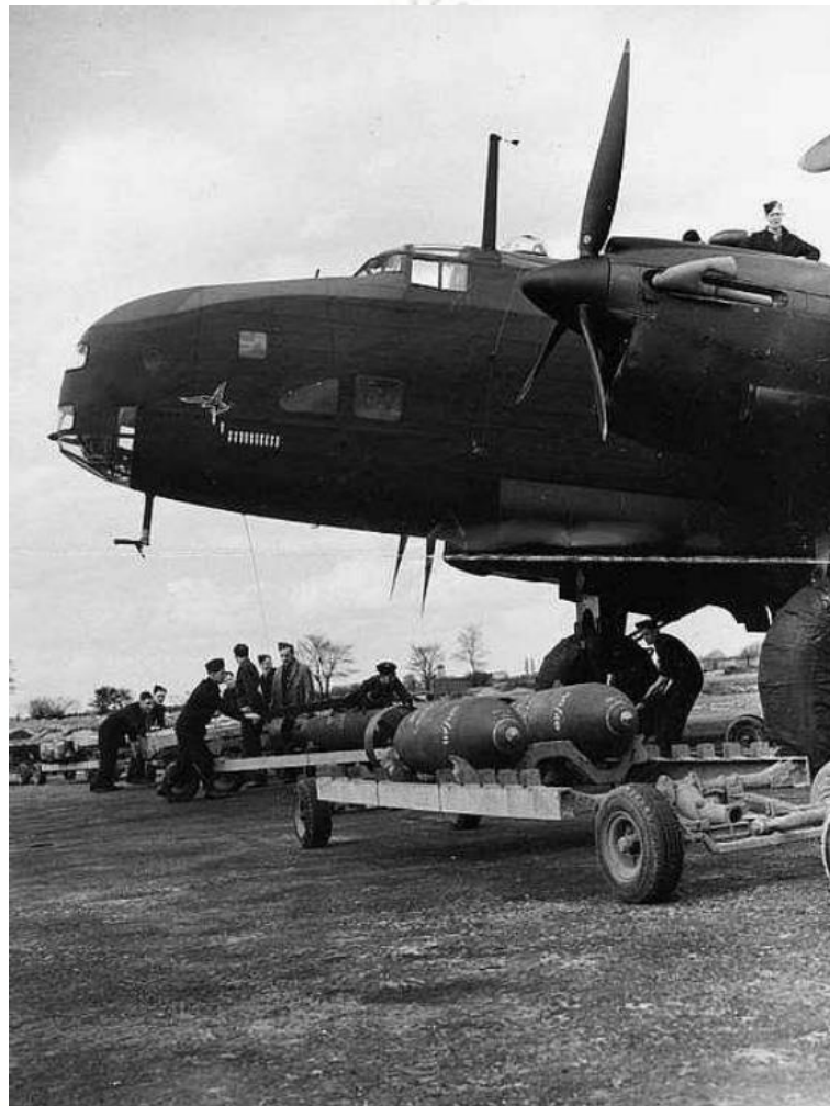
No 76 Squadron Halifax, W7805/MP-M, being bombed-up at Linton-on-Ouse, 3 April 1943.